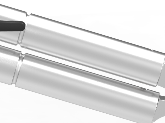
Standard Bone, Head or M2 Riser to M2 Riser